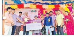
ప్రదర్శనలో మొదటి స్థానం దక్కించుకున్న వ్యవసాయ డ్రోన్ ప్రాజెక్టుకు నగదు బహుమతి అందజేస్తున్న అతిథులు